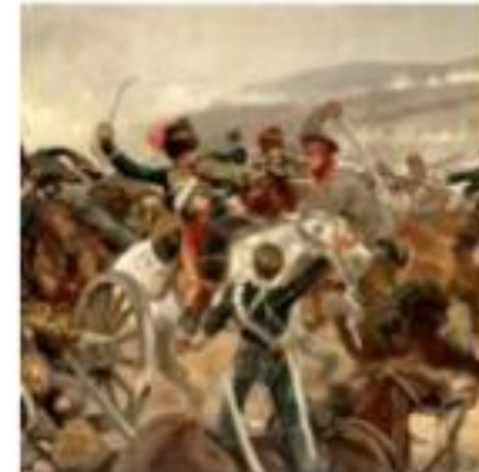
Crimean War 1853-1856