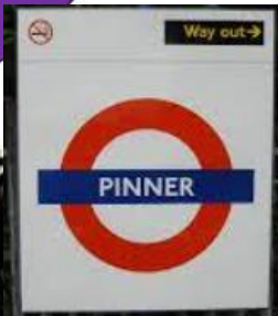
OLD PINNER High Street, c.1900