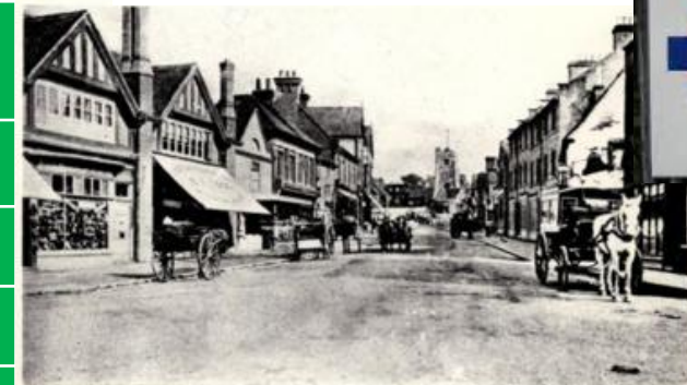
HARROW LIBRARIES Postcard Series No. 4/4